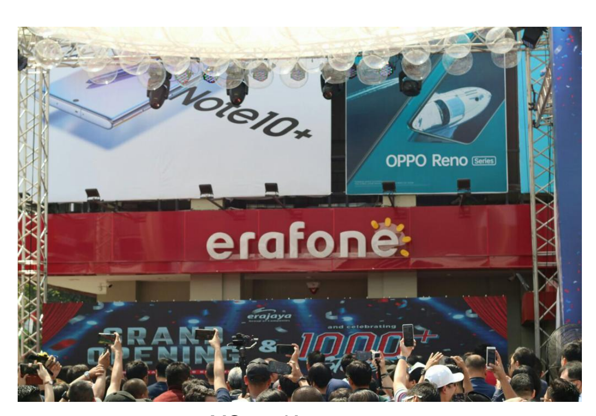
MS 3.0 Kemang